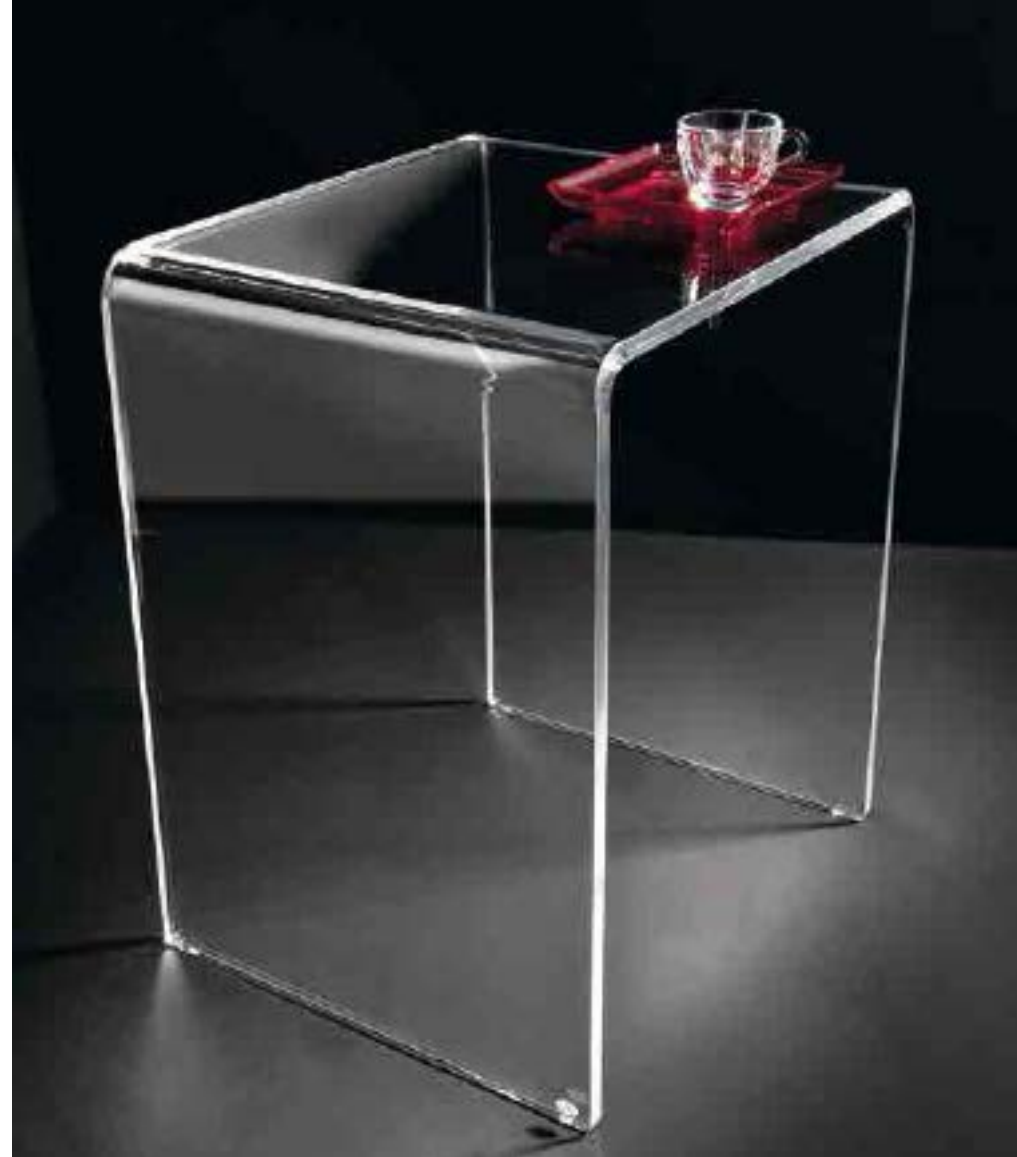
bedside table with shelf