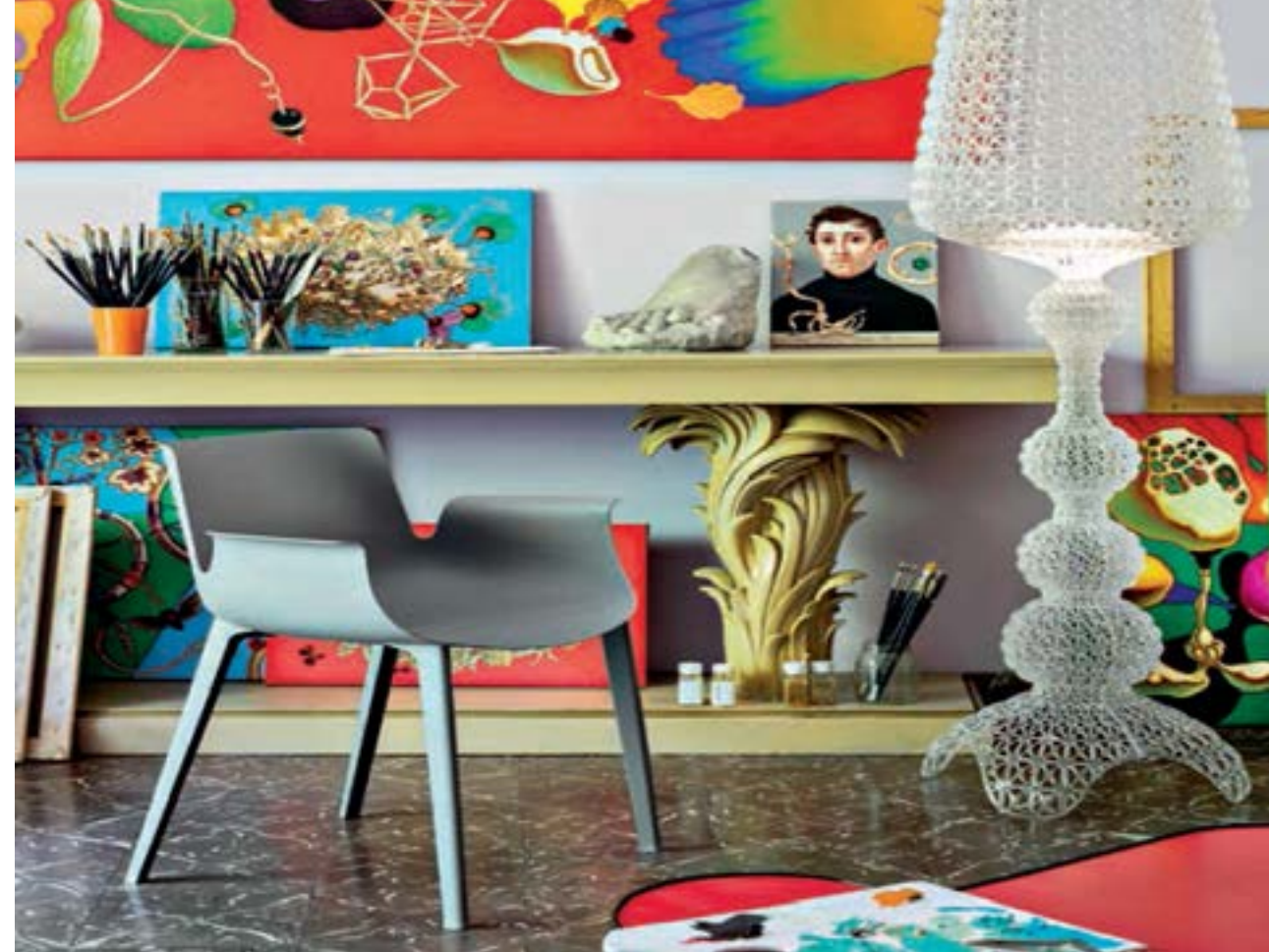
Material Complex thermoplastic polymer with carbon fibre width : 62 cm 24,40 in height : 77 cm 30,315 in