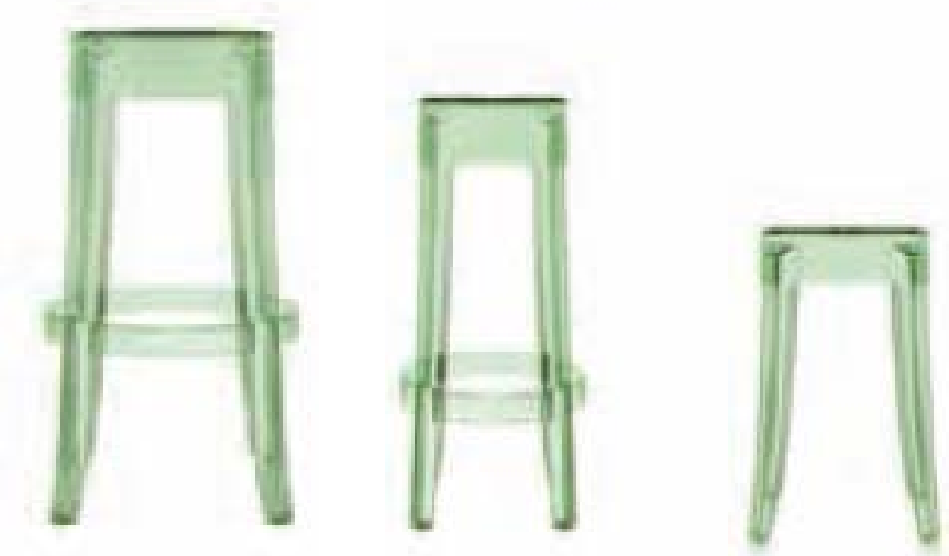
Material Complex thermoplastic polymer with carbon fibre