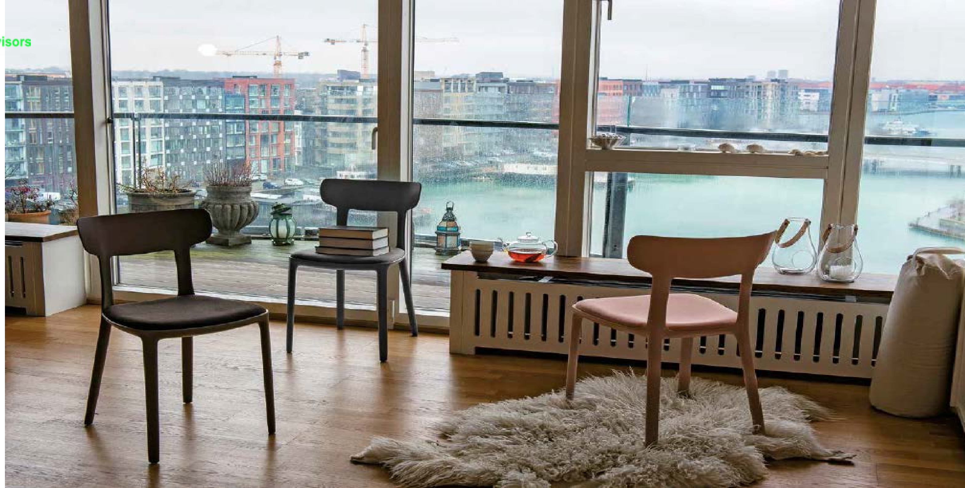
a chair with a classic and light design whose shape and colours ennoble the material of its structure.