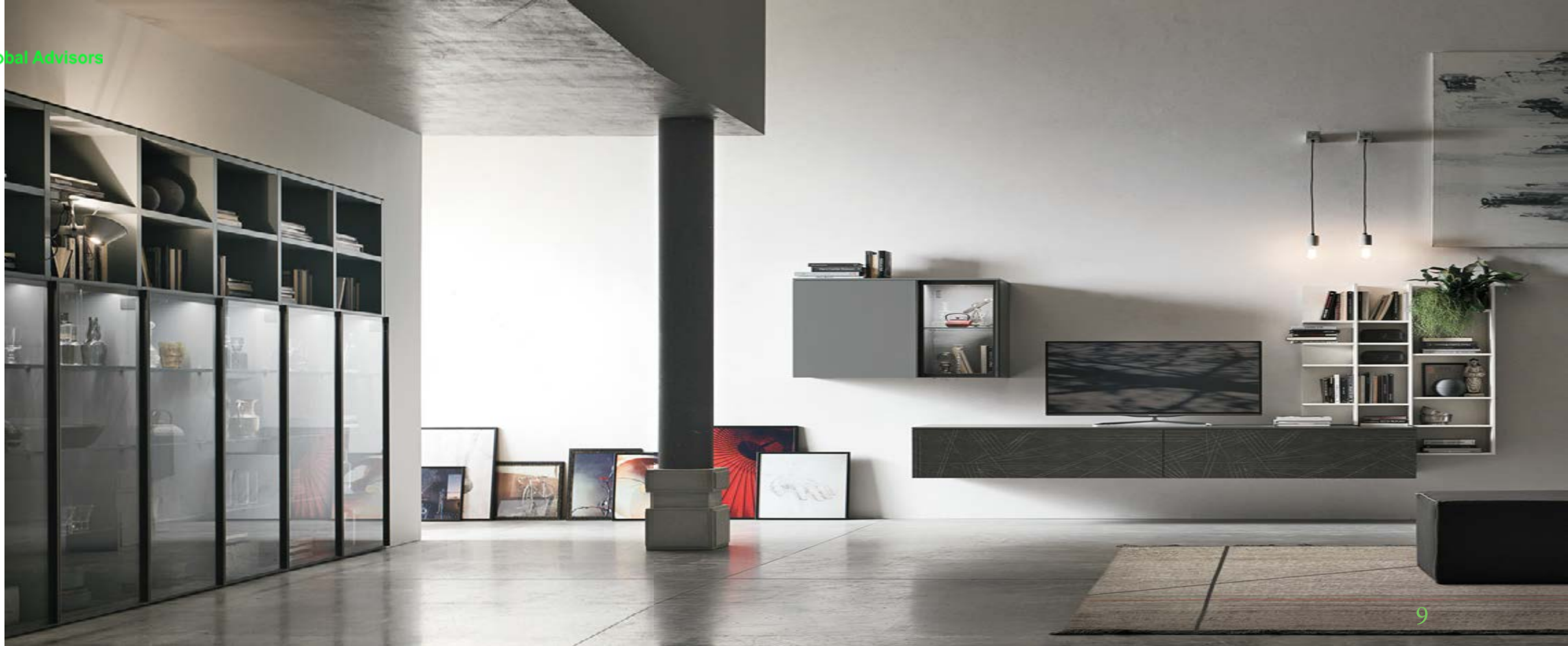
Wall-hung base units in matt anthracite 160 lacquer and doors with graphic decor .Vertical Biblo unit in textured light cement. Matt soft grey lacquered wall unit with Metropolis door in transparent glass.