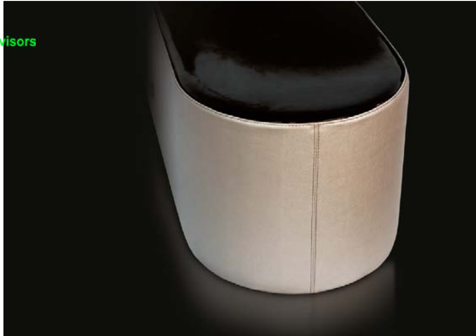
Multilayer and polystyrene structure. Polyurethane padding with different densities. Eco-leather or fabric covering. (available in different color combinations)